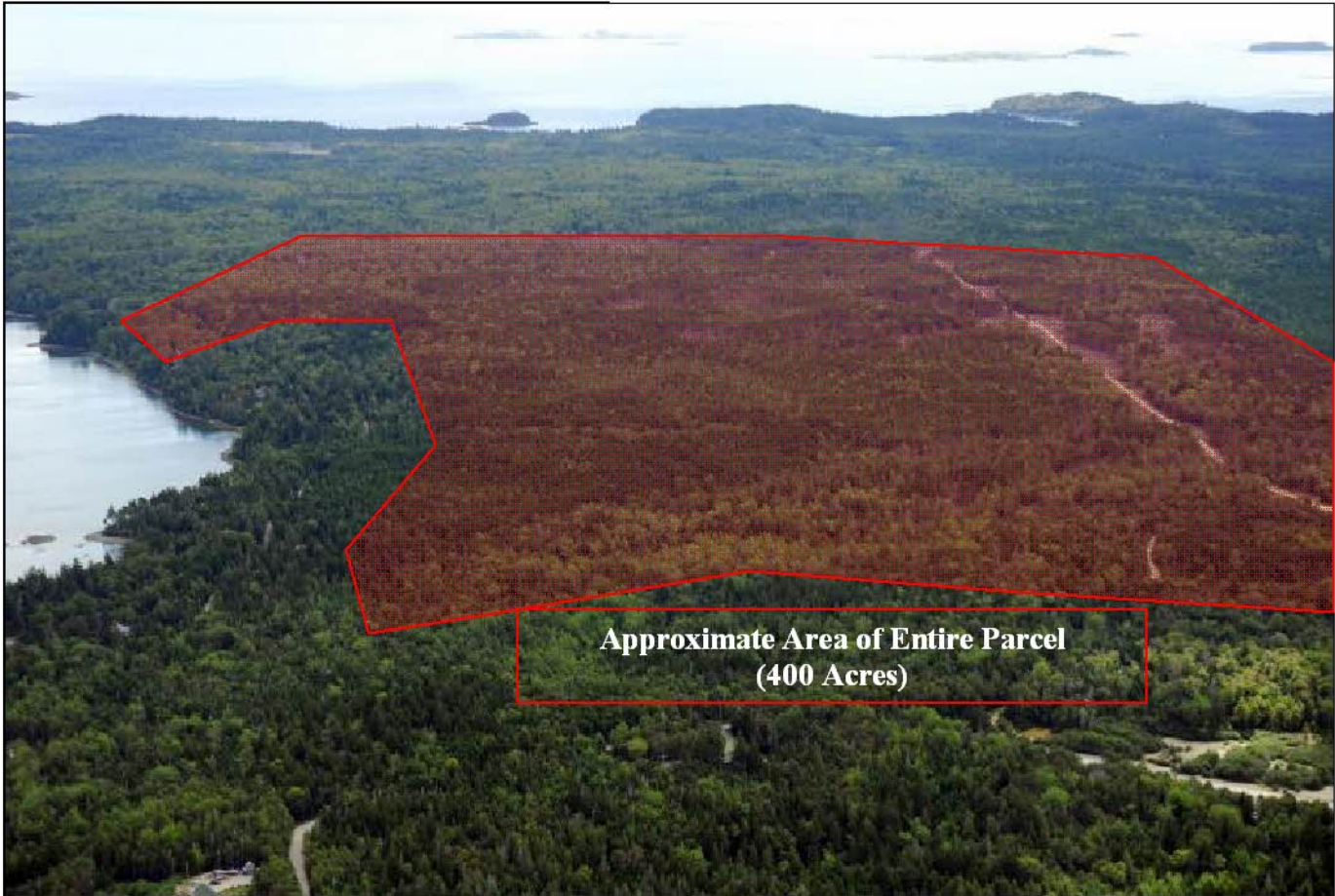
Approximate Area of Entire Parcel (400 Acres)